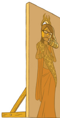
Illustration by Gene Luen Yang

The best-case scenario is that my teachers were consciously giving me freedom to experience the pleasure of reading without adult interference. But would it have diminished my enjoyment if an educator had raised questions about race in The Chronicles of Narnia or The Secret Garden , for example? Looking back, I don't think so. Especially if that educator had appreciated these stories as much as I did.